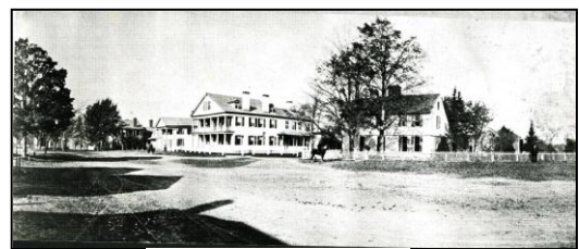
Kibbe Hotel 1880

At all meetings and gatherings, rum and liquor was voted upon for the occasion usually by the gallon or barrel full and always recorded in the town records. Cider brandy was $.25 per gallon and American gin $.40 per gallon.